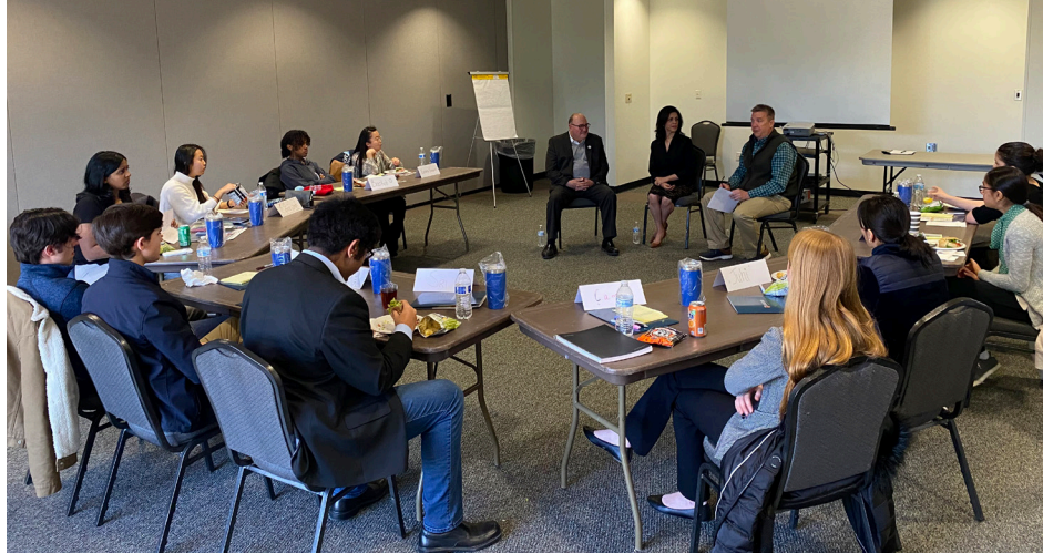
Students listen to the lunchtime panel discussion

Stay tuned for information on the fall edition of Five-Star Character! Interested students and families can learn more at georgemarshall.org/elc . ★