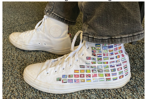
Custom sneakers sported by a student