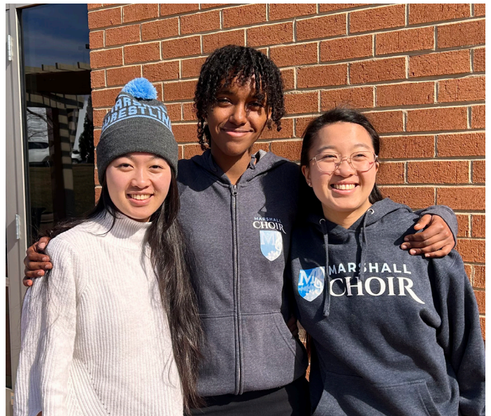
Students from George C. Marshall High School