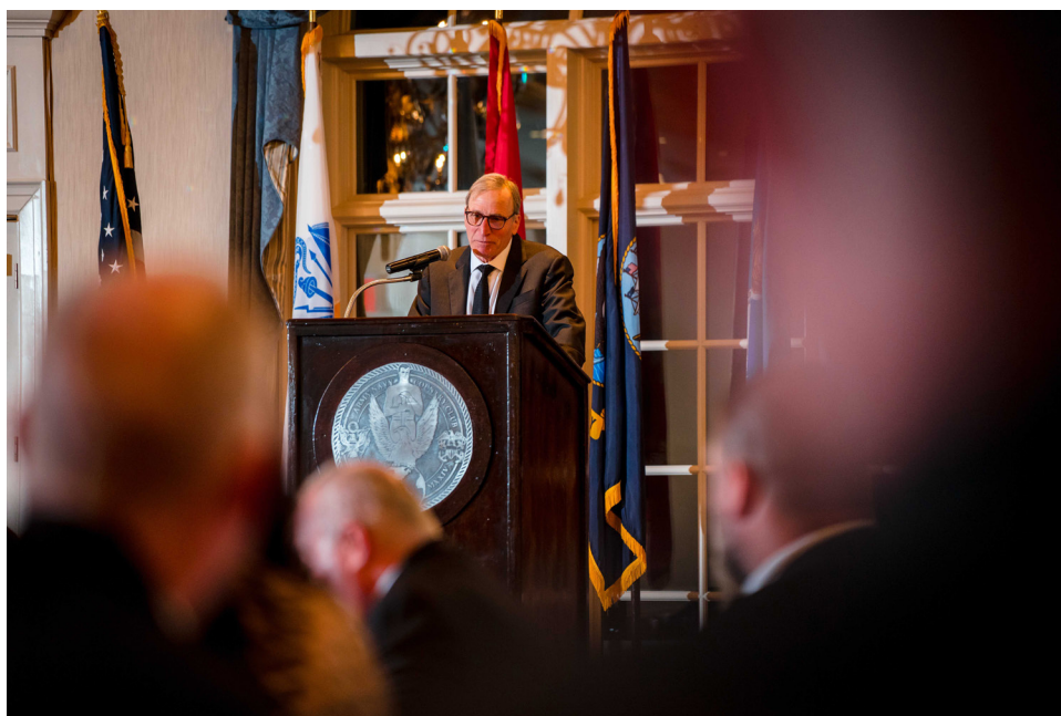
Keynote Speaker Joseph D. Kernan

remarked that, "The work of the George C. Marshall International Center is invaluable. Everywhere we turn, we see a critical need for values, discipline and perseverance in our leaders - a special combination that General Marshall embodied."